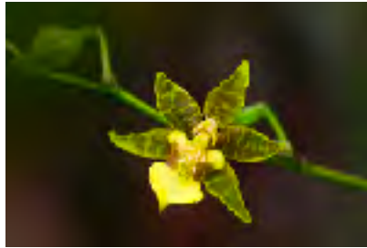
Oncidium ensatum (Florida Oncidium or Dancing Lady)

Native terrestrial that prefers shady spots with mulch. Plant at the base of a tree or in a flower garden.