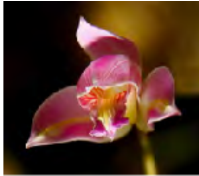
Purpea Bletia (Pine Pink)

Flowers from December to March. This plant prefers a shady spot with mulch but grows well in a variety of landscapes.